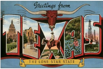
Roast Beef and Gravy