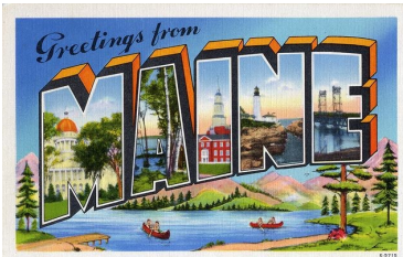
Tomato Soup *