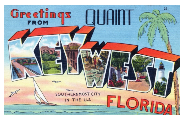
Key Lime Pie